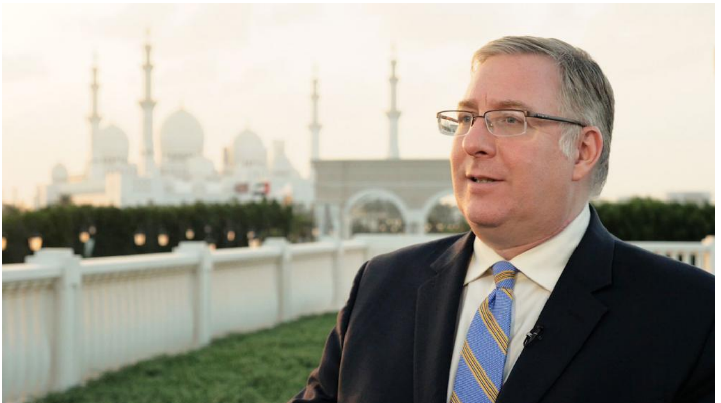
Joel Rosenberg in Abu Dhabi

Family Research Council President Tony Perkins said he was inspired by the "powerful faith" of Christians in the UAE.