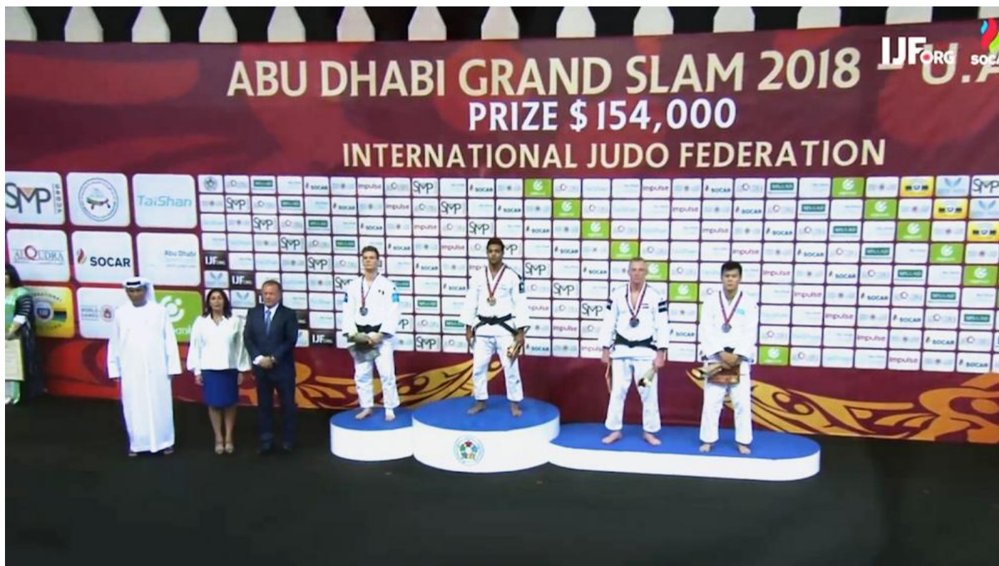
Israeli Gold Medalist Judoka Sagi Muki, Screen Capture